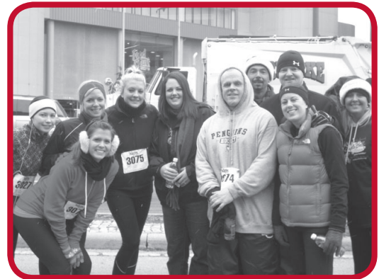
Focus Southwest Jingle Ballers at the 24th Annual Jingle Bell 5k Run/Walk in downtown Columbus.

Overall, it was a great way to get into the holiday spirit and they look forward to next year's race!