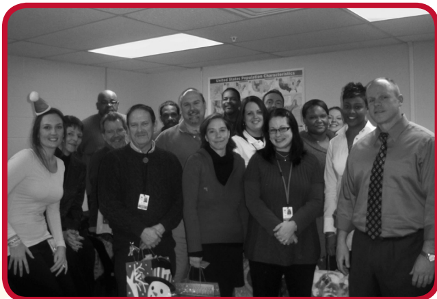
Focus Learning Academy Southwest Board Members and staff celebrating the holidays.