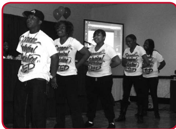
The CTE Steppers put on an explosive performance at the CTE Awards Ceremony on May 24.

This year was the first year for the CTE step team and they were dynamic. These students put their best foot forward and showed off their skills with teamwork, determination and creativity. The CTE Steppers started the year off with a challenging and extraordinary performance in front of the whole school and ended in an explosive performance at the CTE Awards Banquet. These students hard work and dedication paid off and they were asked to perform at the REBEL All Night Teen Summit!! GREAT JOB TEAM!!