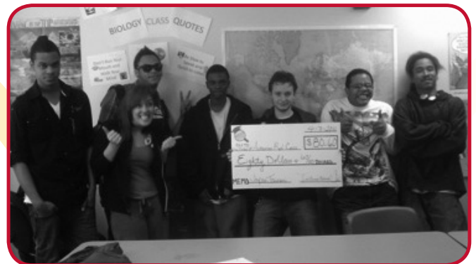
The Focus East International Club with a check donated to the Red Cross to help out with relief efforts in Japan.

Students also decided help out after the devastated earthquake and tsunami in Japan. Students helped sell Krispy Kreme donuts to staff and students at all of the Focus locations. A check was donated to the Red Cross for $100 on behalf of the International Club.