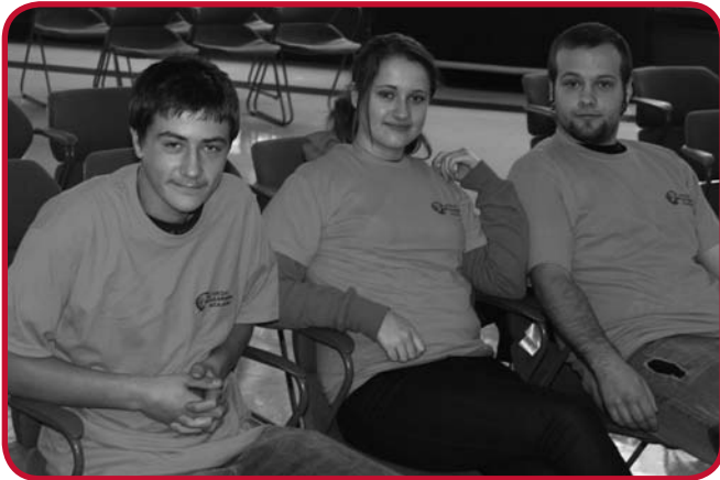
Focus Southwest students at the Back to School, Back to Peace Think Tank on September 15.

Focus Learning Academy, along with York Masons at The Kings Arts Complex and Ezekial Lodge # 4, hosted a "Back to School, Back to Peace" Think Tank on September 15. This event was an opportunity for Columbus youth and the community to come together to discuss stopping teen violence.