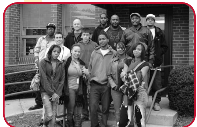
Focus students and staff at Focus East before leaving to the viewing of "The Interrupters" at The Wexner Center for the Arts.

from the movie and came up with ways to implement what they learned in their everyday lives.