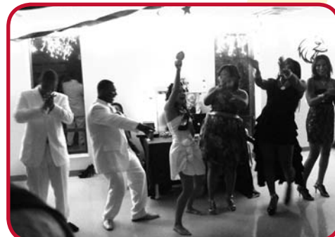
Focus North High School students, staff and guests (Miss Black Ohio in middle picture) from the 2011 Focus North High School Spirit Week and Homecoming Dance.